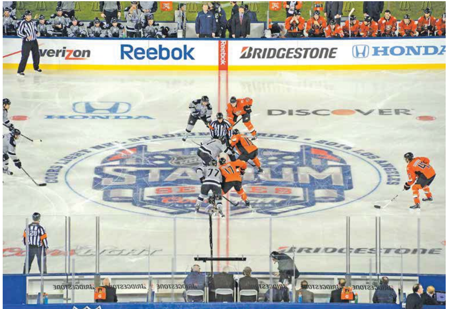
Kings and Ducks advance as the referee drops the puck during the the 2014 Coors Light NHL Stadium Series game between the Anaheim Ducks and Los Angeles Kings at sold-out Dodger Stadium. Press release provided by L.A. Kings. For story and more photos see page 5.